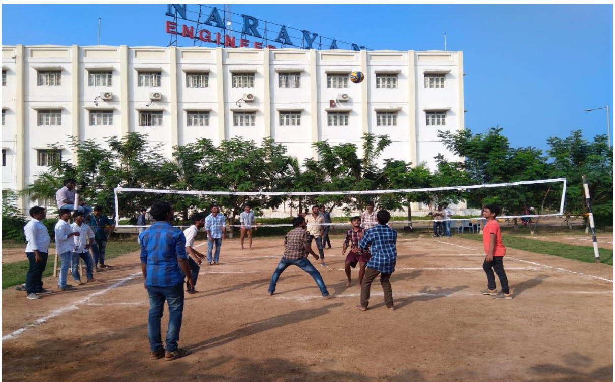
Volley Ball Competition for Boys