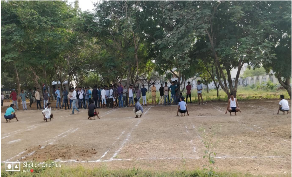
Kho - Kho Tournament for Boys