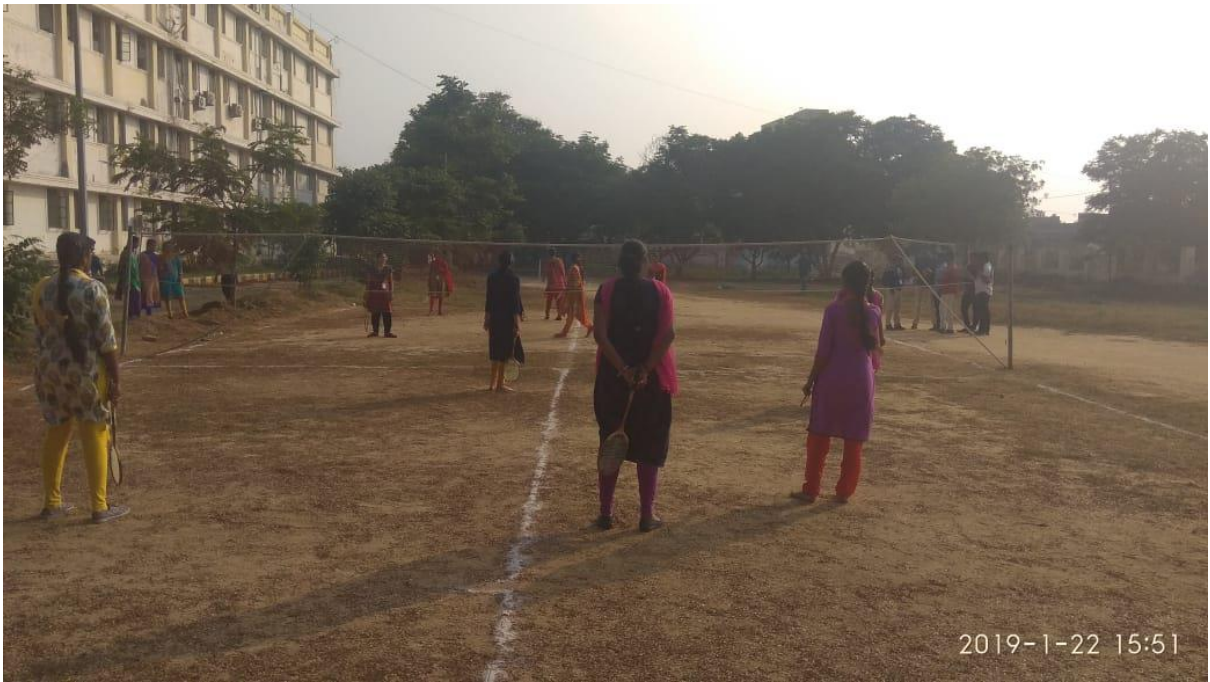
Ball-Badminton Games for Girls